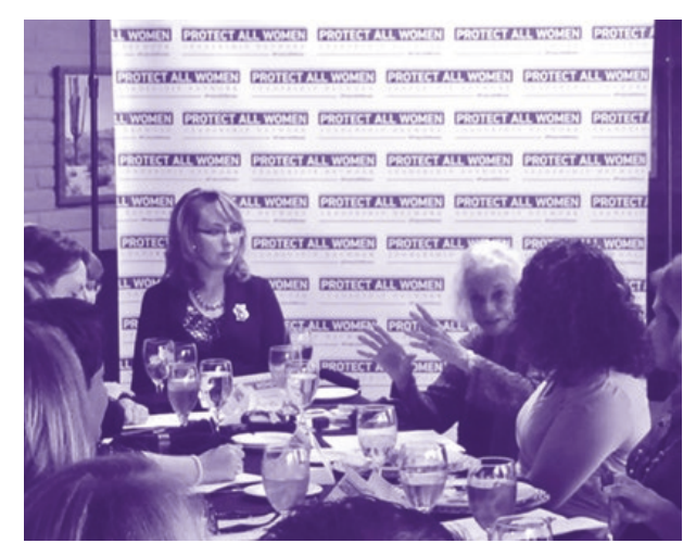
Gabby Giffords attended a meeting at the O'Connor House on the issue of domestic violence.

$542,000 to address community violence as a public health crisis through training and broader public outreach.