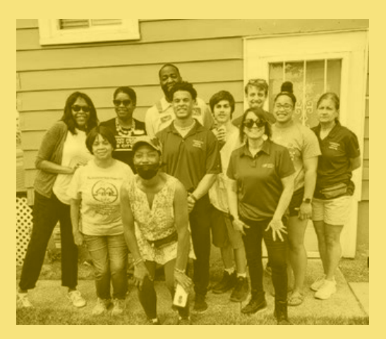
Mediation Response Unit assisting with a neighborhood block party to engage folks in talks on how to improve their neighborhood

Community member who called police for a disorderly person on their premises